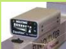
Dual Sided Stitch Regulator