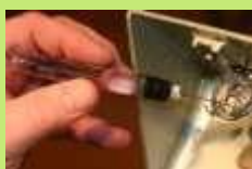
Easy Access "L" size bobbin