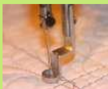
Round Foot for ruler guides